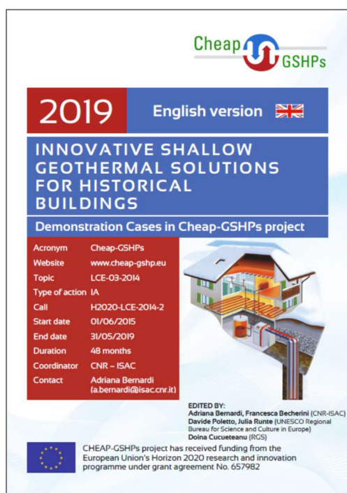
Title page of Cheap-GSHPs project report on historic buildings